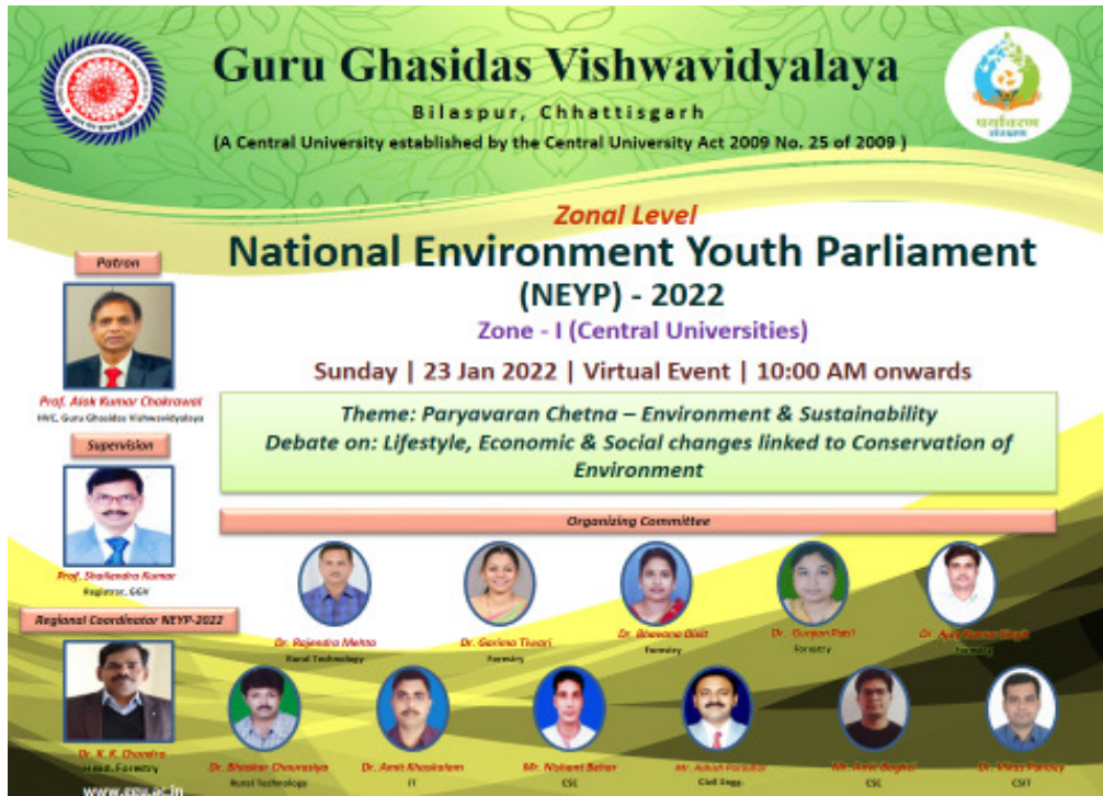
Flyer of the regional Events