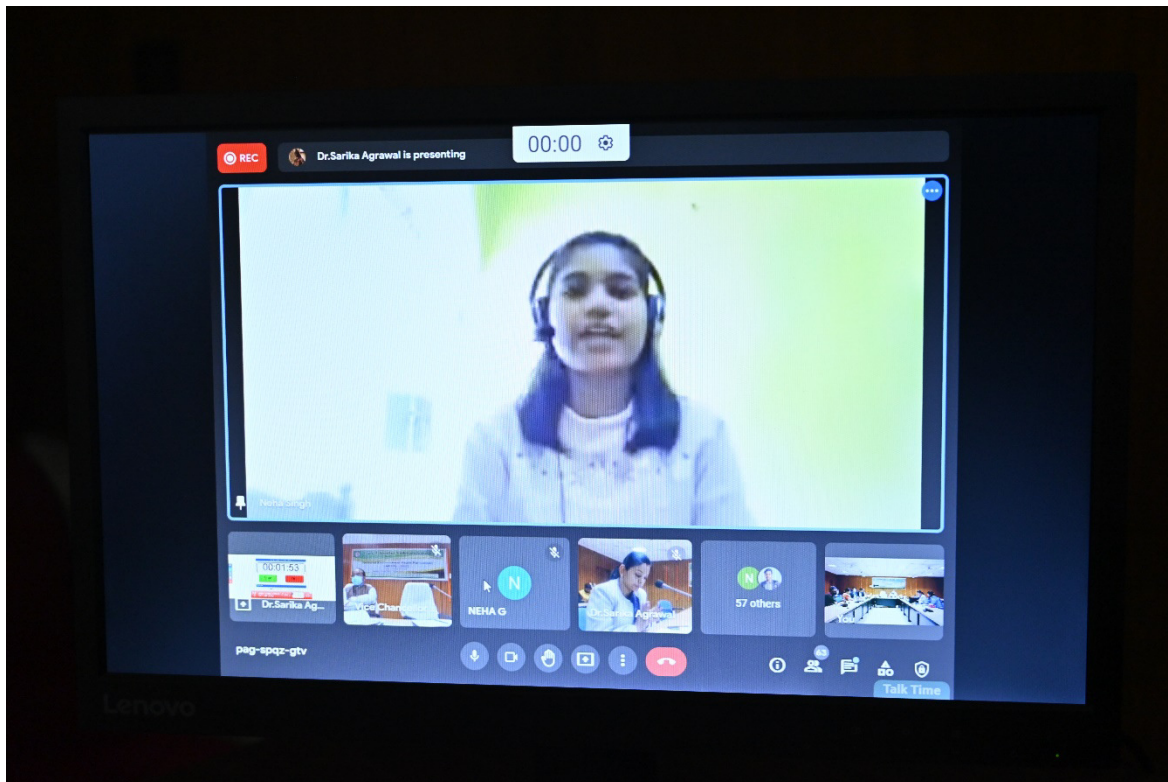
Participants presenting online during NEYP 2022