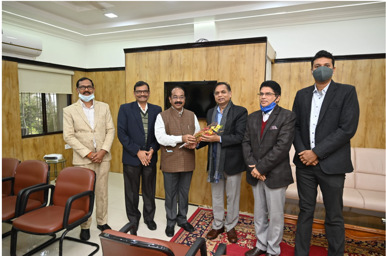
Welcoming of Jury Members by Vice Chancellor, GGV