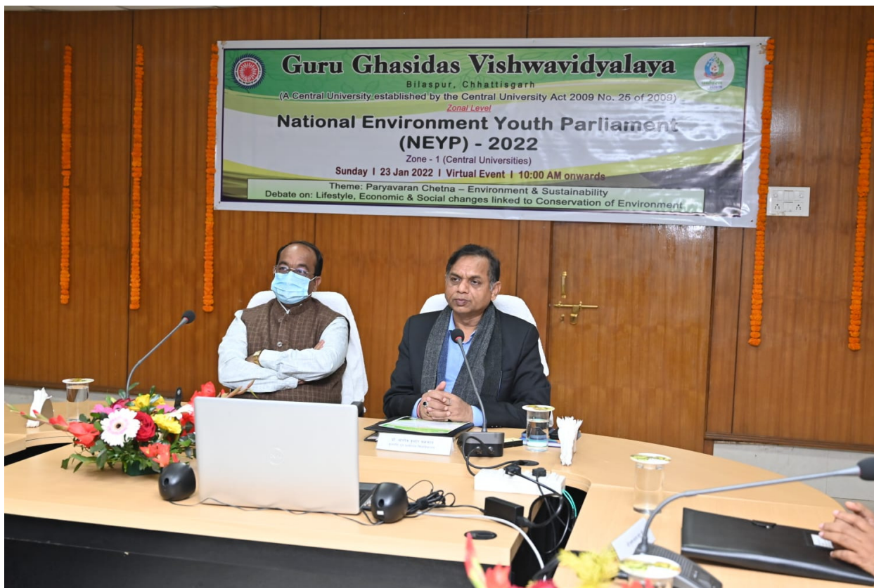
Judging the participants during NEYP Competition 23 January 2022