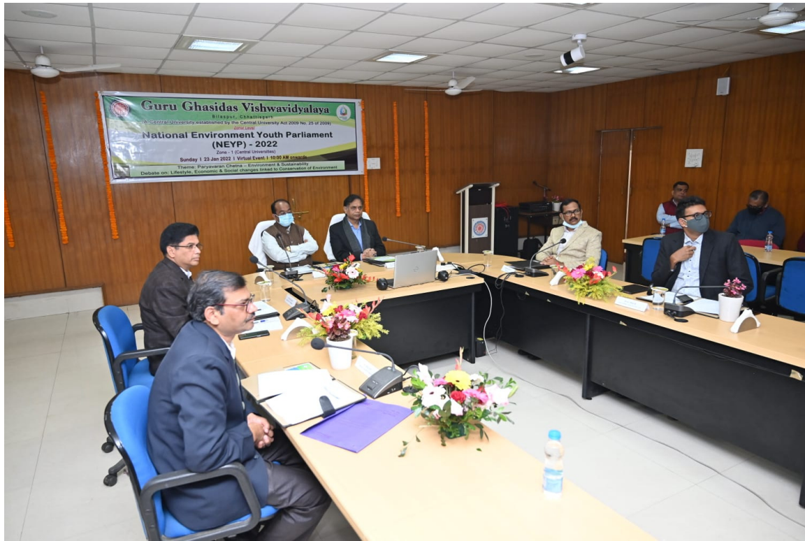
Honorable Judges listening the view of participating students on NEYP 2022